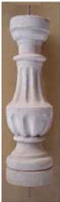
Rondo Nena 23 1/4 " H 7 1/4 " Rd Top 7 1/4 " Rd Bs ambrn