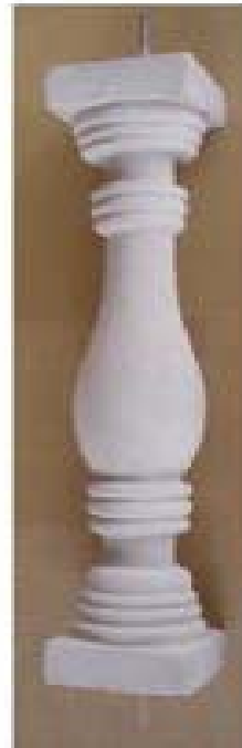
Tres Sierras 30 7/8 " H 6 " x 6 " Ends ambst