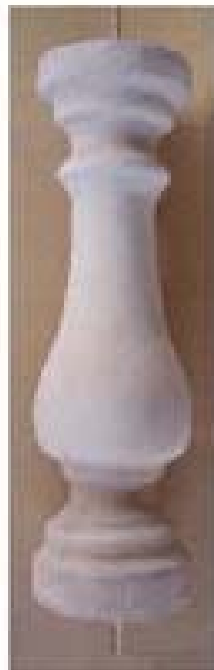
Rondo Mario 23 1/2 " H 6 1/2 " Rd Top 7 " Rd Bs ambrm