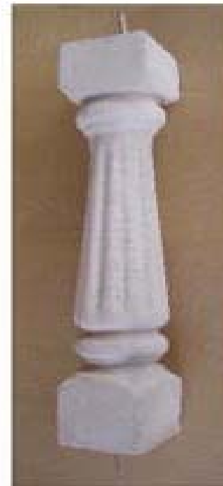
Ornate Sierra 26 1/4 " H 5 1/4 " x 5 1/2 " Top 5 1/4 " x 6" Bs ambs0