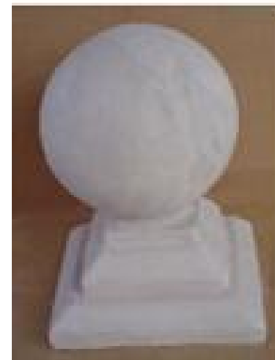
Sphere Pinnacle 12 ¼ " High 8 ¾ " x 8 ¾ " Bs ambb