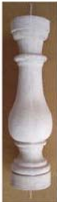
Rondo Alta 23 1/2 " H 6 1/2 " Rd Top 7 1/4 " Rd Bs ambla