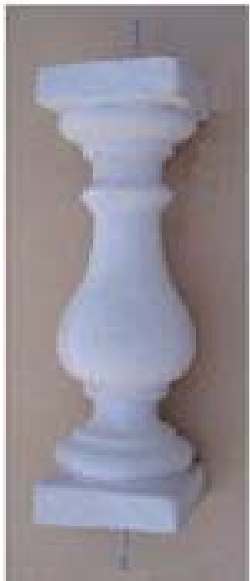
Sierra Chico 23 1/2 " H 6 3/4 " x 6 3/4 " Ends ambsc