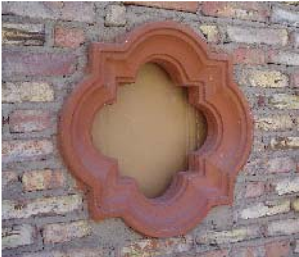
Grande Porthole 30 ½" outer across 20 ¾" inner across