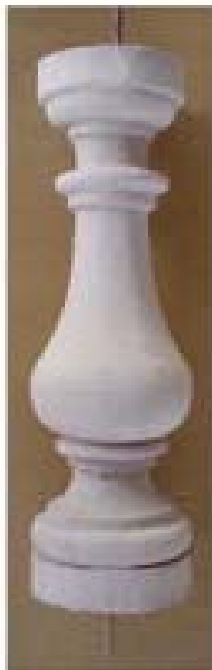
Rondo Chico 23 1/2 " H 6 " Rd Top 6 1/4 " Rd Bs ambrc