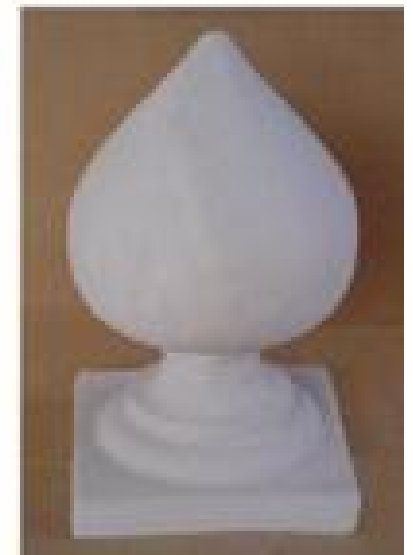
Tear Pinnacle 16 " High 8 ½ " x 8 ½ " Bs ambt