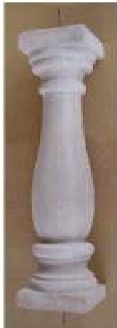
Sierra 305 30 1/2 " H 7 " x 7 " Ends amb5