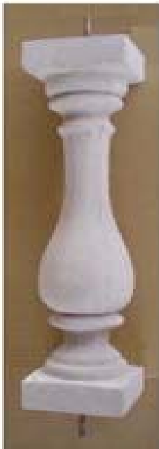
Sierra 26 26 7/8 " H 7 " x 7 " Ends amb2