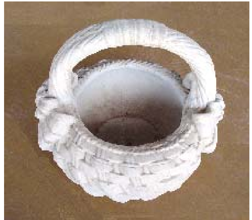
Belle's Canasta 18" W x 18" H