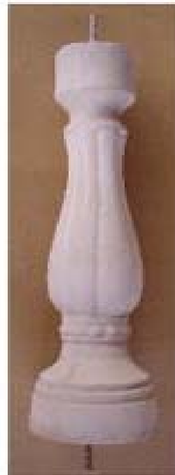
Squash Rondo 24 3/4 " H 5 1/4 " Rd Top 7 3/4 " Rd Bs ambrs