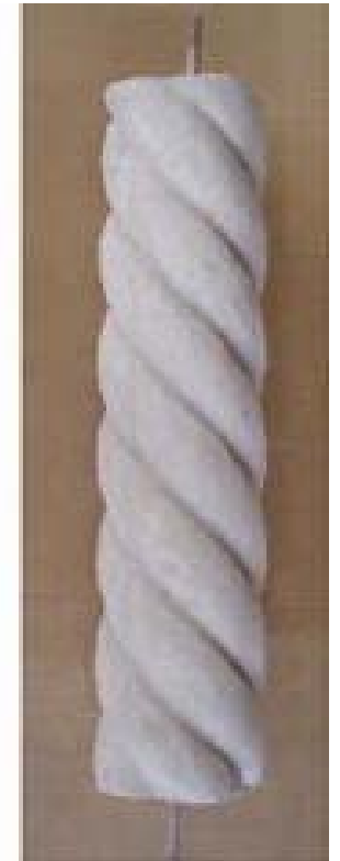
Rondo Spiral 29 " H x 6 1/4 " Rd ambrp