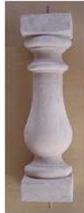
Sierra Largo 31 7/8 " H 6 3/4 " x 7 " Ends ambsl