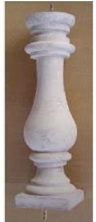
Rondo Sierra 41 1/4 " H 8 " Rd Top 8 3/4 " Sq Bs ambsr