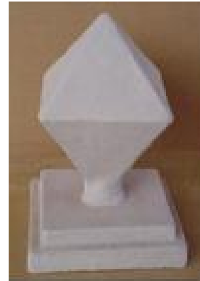
Rhombus Pinnacle 15 ¼ " High 10 ¼ " x 10 ¼ " Bs ambr

Columns, Balustrade, Handrails, Fireplaces, Arches, Tile Roofs, Walls, Fences, Walkways, Patios, Pool Decks, Landscaping, Driveways and Rustic Custom Works.